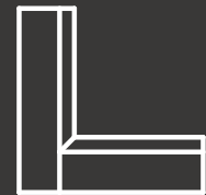
Mechanical Joint Heritage Look